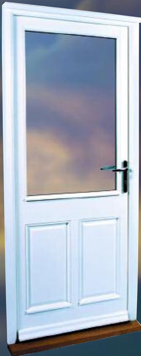
Continental style, British winter performance

We have improved our extensive range of door sets with the introduction of a revolutionary new range of hemlock panel and French Casement doors.