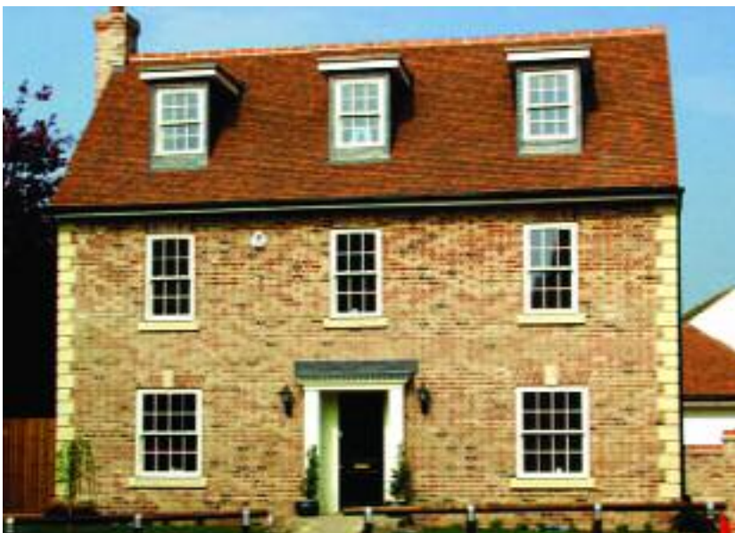
Photograph courtesy Brydon Estates (UK) Ltd, main contractor Frudd Construction Ltd.

Windows up to 635 wide have no ventilators fitted. From 635 wide to 1084 will have 4000 mm 2 and 1085 and over will have 8000 mm 2 ventilation.