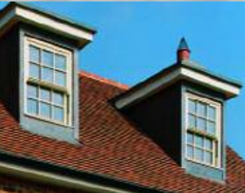
(left and right) Photographs by kind permission of CMB Brampton Ltd