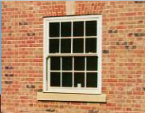
Sliding Sash All Bar with cambered head