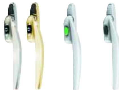
Titon Polished Chrome effect and Polished Brass effect available at extra cost. (above, shown in white) Titon Fire Escape handles. (above, shown in white) Titon Push To Unlock handles.

Titon Fire Escape, Push To Unlock handles and Standard Stays are also available in all the above standard colours and Polished Chrome effect or Polished Brass effect.