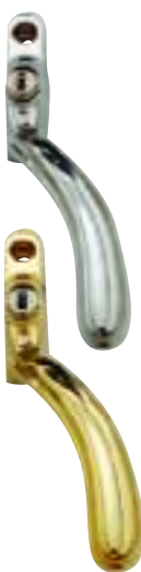
Legend Espagnolette Handles. Polished Chrome effect and Polished Brass effect available at extra cost.

NOTE: Legend handles are only available on Shootbolt and Espagnolette locking systems.