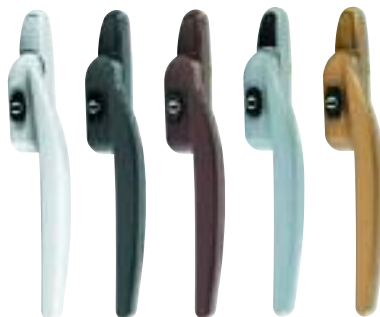
Titon Standard Range of handles are available in the following standard colours: White, Black, Brown, Silver and Gold.

Ironmongery options are available from Howarth