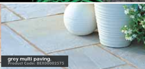
grey multi paving. Product Code: BEX00002575